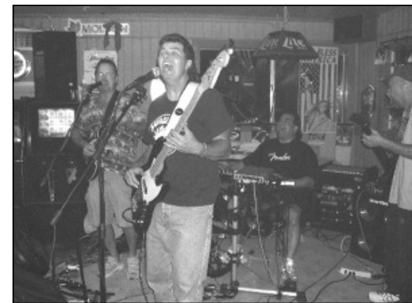
Submitted by Elizabeth Henderson

For those of you who haven't heard the newest rock band in the upper keys, HAV-AT-IT, you're in for a real treat. This band really rocks, and does so at a controlled volume, because they use an electronic drum set. If the music gets too loud, they can just turn down the volume with the touch of a button. The variety of music they play is like a breath of fresh air for those who are tired of hearing the same old songs. These guys play everything from America to Zeppelin.