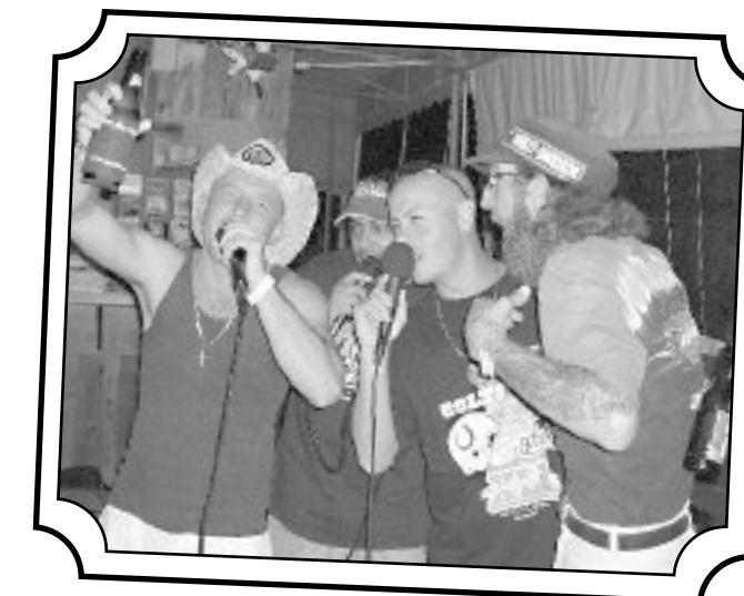
Karaoke singers at the Pilot House given it their all.