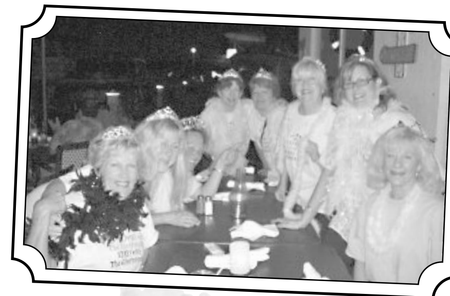
Girls Night Out at the Pilot House. Their shirts read "What happens with the girlfriends stays with the girlfriends".