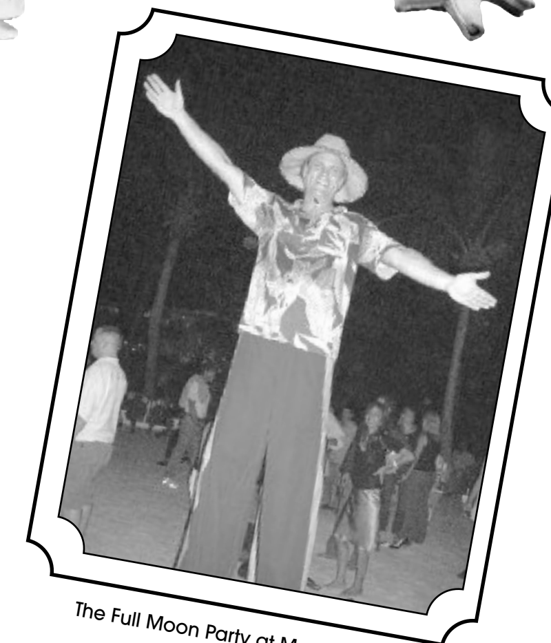
The Full Moon Party at Morada Bay is always large!