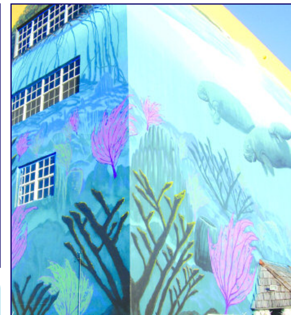
The finished building sits in the median at MM 99.2 in Key Largo. If you are going south look for the beautiful rays swimming and going north take a look at the large Manatee.