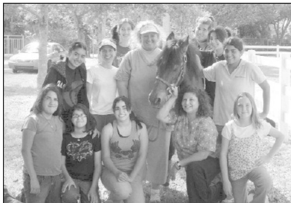
Healis Hippotherapy's therapists and volunteers.

allows the patient to develop new posture and movement strategies.