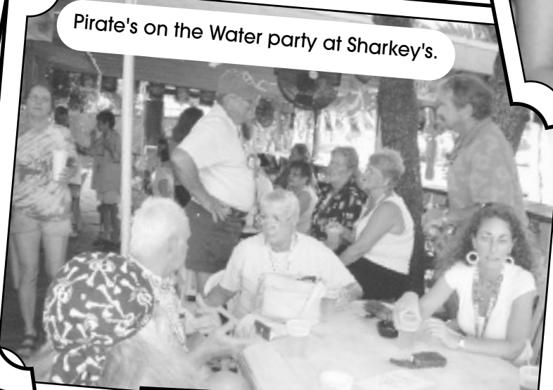
Pirate's on the Water party at Sharkey's.