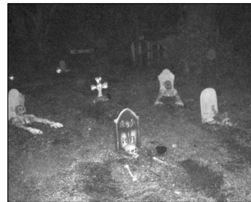
The Key Largo Fire Station Haunted House graveyard was sooooo scary!