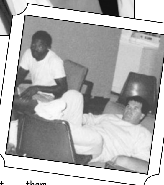
Right: Pete Rose in the Pokey

been turned in to a movie or maybe they have!