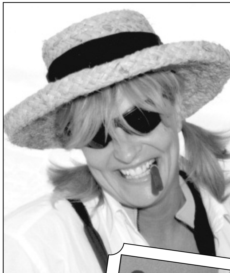
Above: "Gonzo Girl" cigar smokin'.