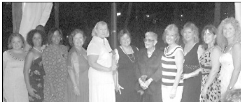
Past BPW Presidents gather at the anniversary celebration.