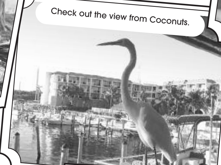
Check out the view from Coconuts.