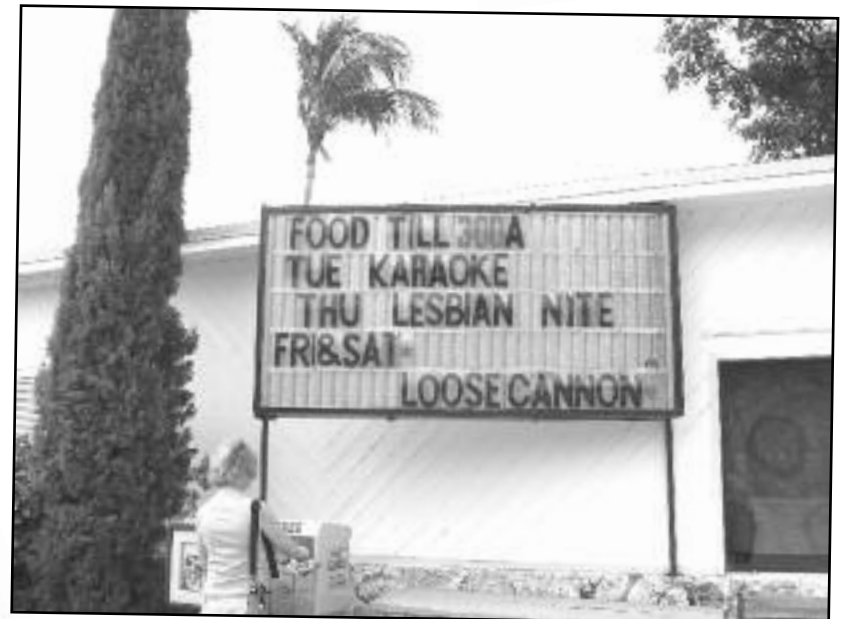
Wonder what the music is like on Lesbian Nite at the Big Fish?