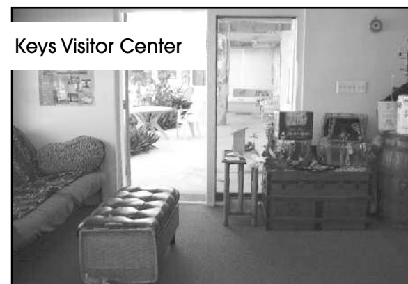
Keys Visitor Center