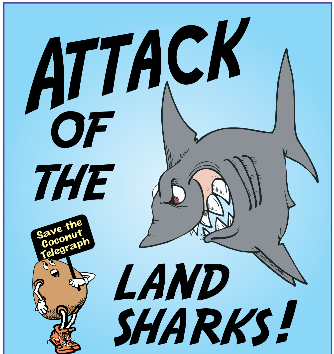
The Coconut Telegraph makes a stand. See Editorial on page 2.

The Coconut Telegraph at over 100 locations from Homestead to Key West