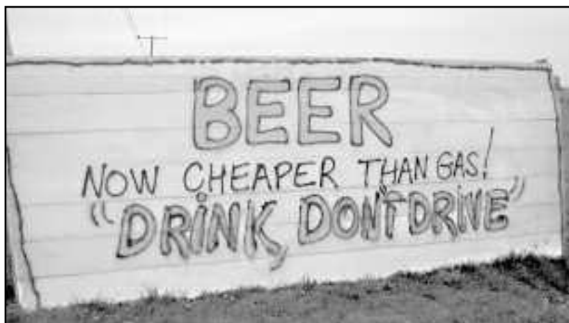
This "Sign of the Times" is on a lawn in Jamestown, New York.