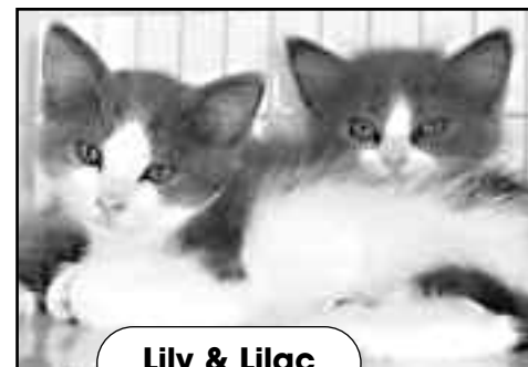
Lily & Lilac