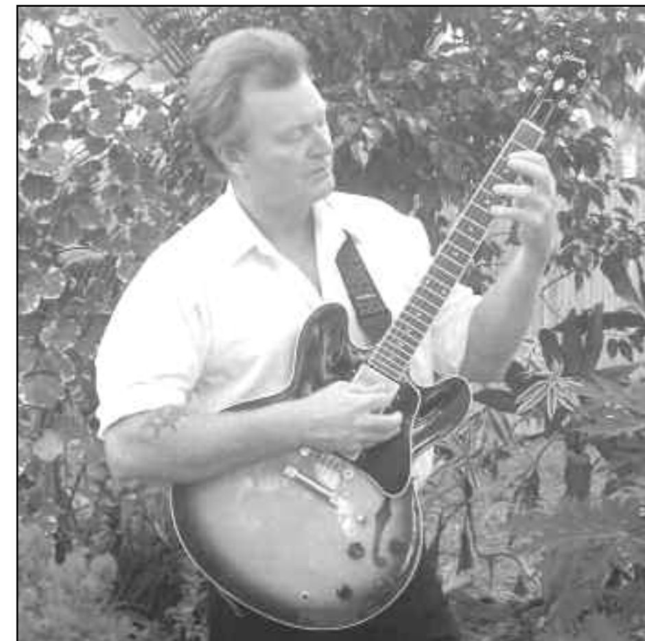
Story by Rich Peine

This month's entertainer of the month is an eclectic person who is not only a fine musician, but also a sailor, commercial diver/welder, oil well fire fighter and best selling author.