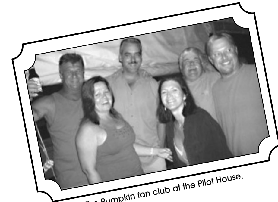
The Pumpkin fan club at the Pilot House.