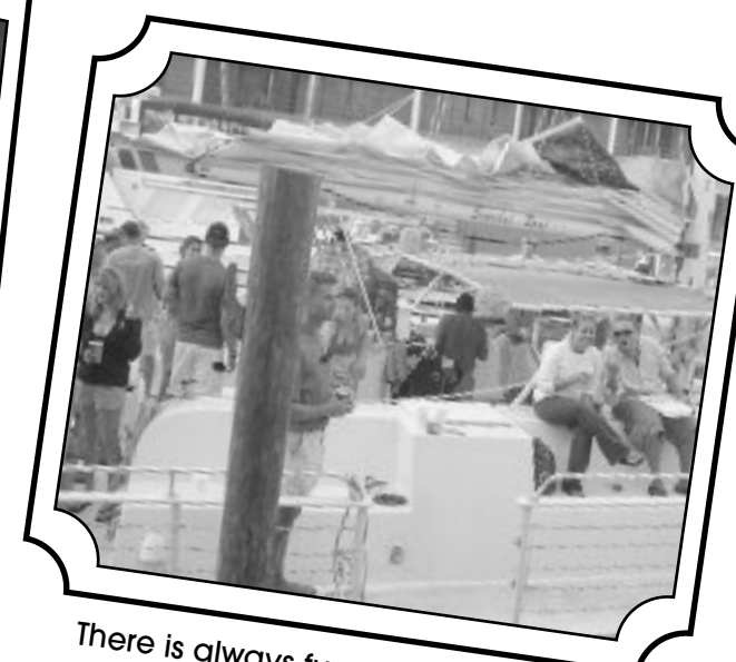
There is always fun on the Quicksilver!