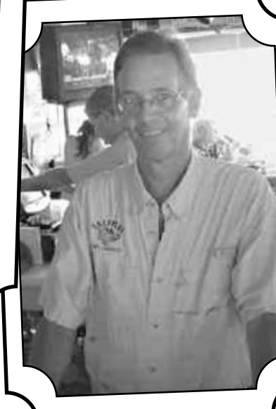
Dicko is back at Snappers!