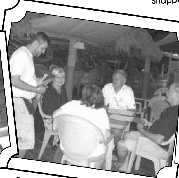
-Diners love Marley's Restaurant at Jewfish Creek.