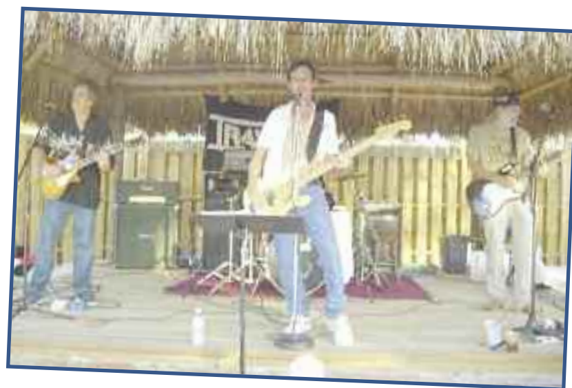
There is always great entertainment at the Big Chill.