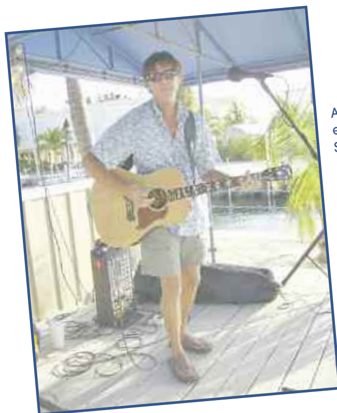
Always great entertainment at SunDowners.