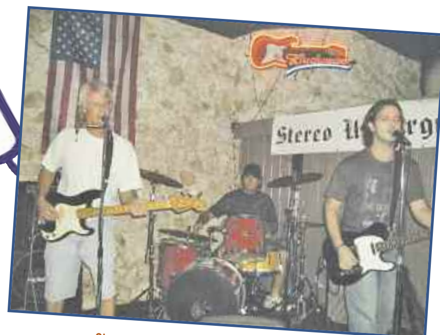
Stereo Underground at Coconuts.