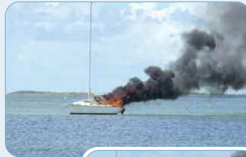
This sail boat recently went a blaze in the bay behind Snook's Bayside Restaurant in Key Largo.