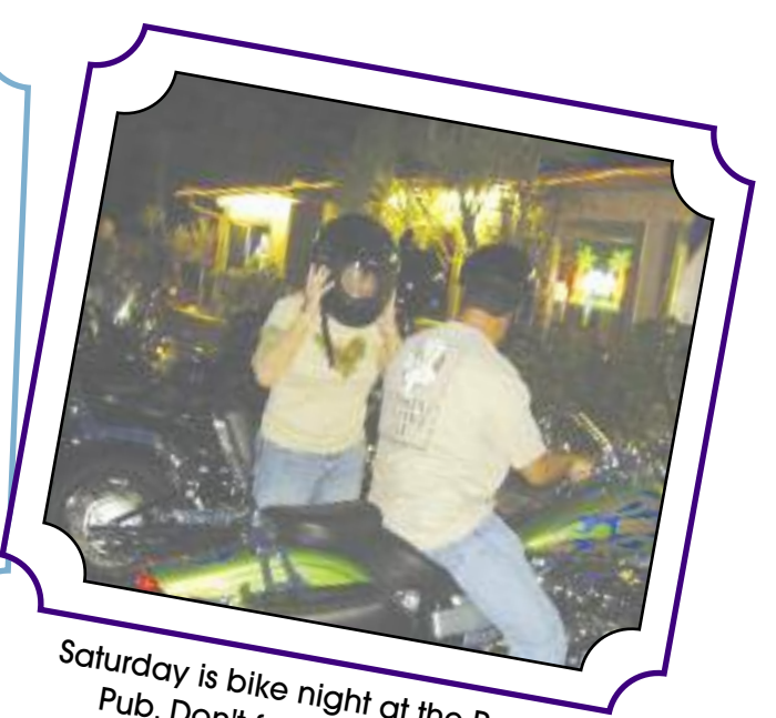
Saturday is bike night at the Paradise Pub. Don't forget your leathers.