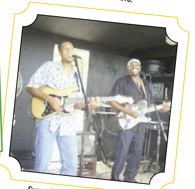
Superb reggae at Snappers.