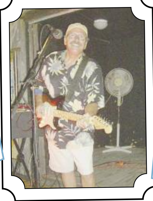
There is always great entertainment at Snapper's Turtle Club!