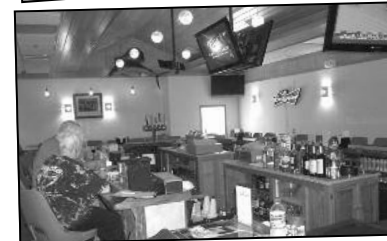
The newly remodeled and reopened Islamorada Moose.