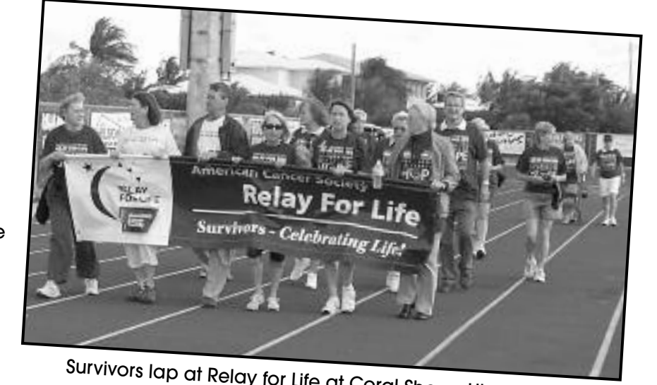
Survivors lap at Relay for Life at Coral Shores High School.