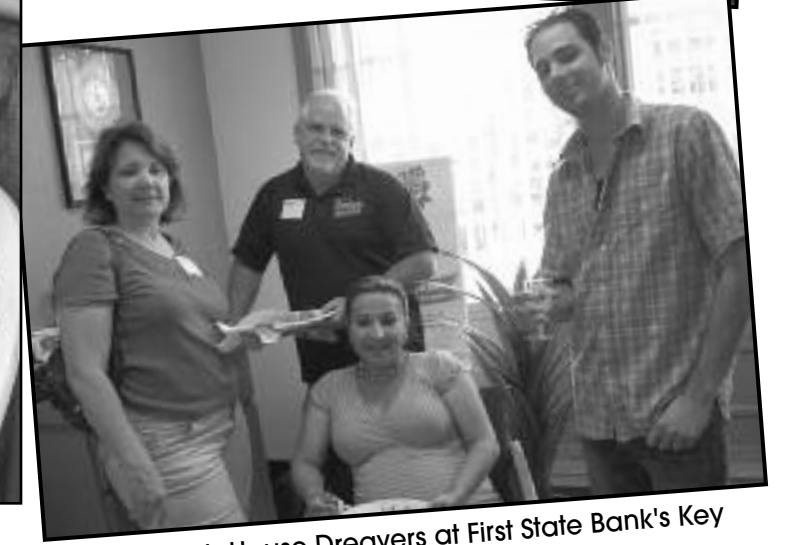
The Conch House Drovers at First State Bank's Key Largo Chamber's After Hours Party.