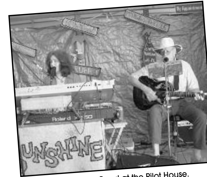
The Sunshine Band at the Pilot House.