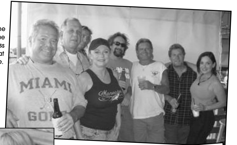
This crew came to check out the new glass bottom bar at the Pilot House.