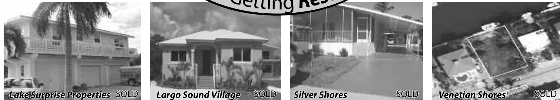
Lake Surprise Properties SOLD Largo Sound Village SOLD Silver Shores SOLD Venetian Shores SOLD