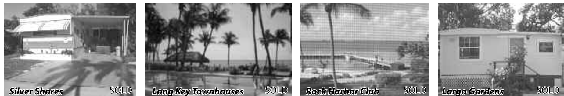
Silver Shores SOLD Long Key Townhouses SOLD Rock Harbor Club SOLD Largo Gardens SOLD