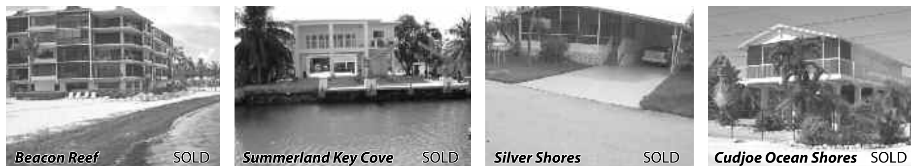
Beacon Reef SOLD Summerland Key Cove SOLD Silver Shores SOLD Cudjoe Ocean Shores SOLD