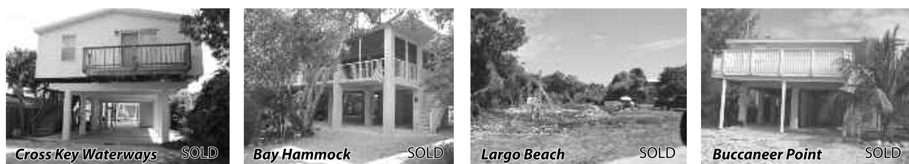
Cross Key Waterways SOLD Bay Hammock SOLD Largo Beach SOLD Buccaneer Point SOLD

We're Working For You Prudential Keyside Properties And Getting Results!