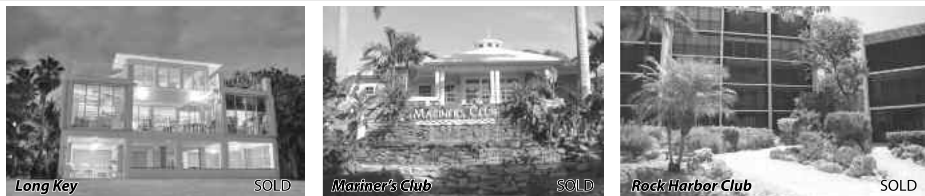
Long Key SOLD Mariner's Club SOLD Rock Harbor Club SOLD