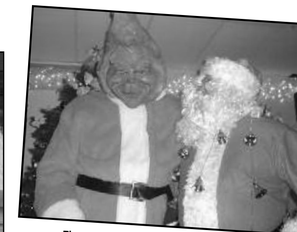
The Grinch meets Santa at the Key Largo Moose.