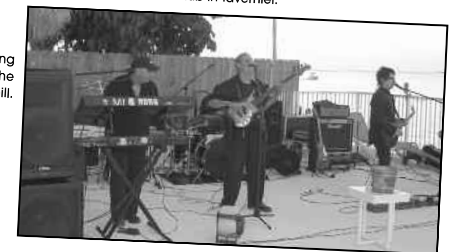
Viva entertaining the crowd at the Big Chill.