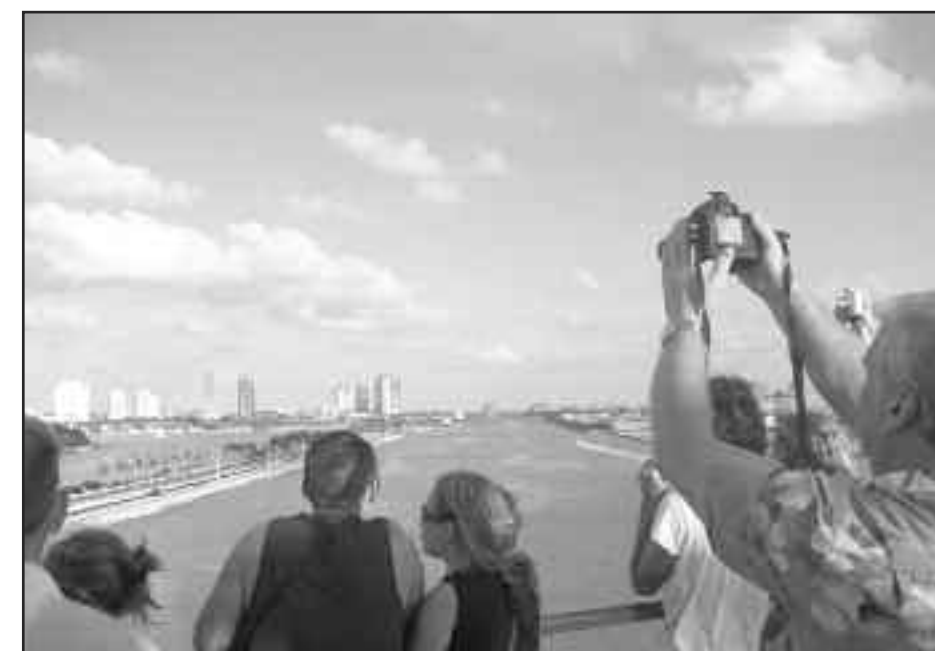
Leaving the Port of Miami the view from the 10th deck of the Norwegian Sky was breathless.