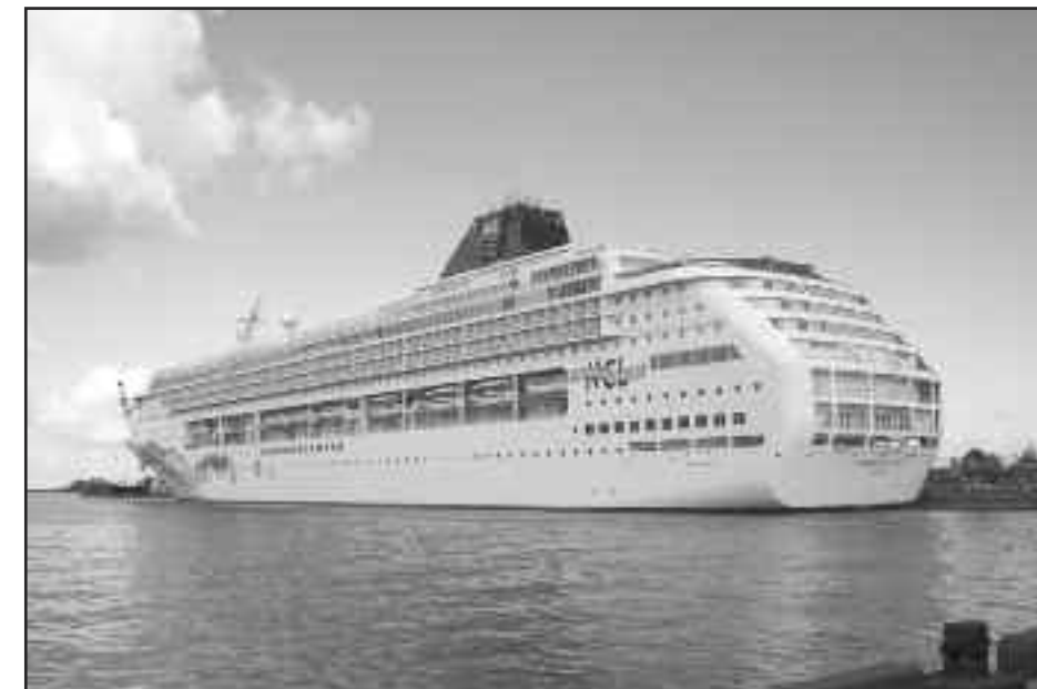
The Norwegian Sky. It's an impressive ship!

Day 1 - We woke up to find ourselves docked in what appeared to be a quarry. The clear Bahama blue ocean was beautiful but the land surrounding us was definitely not. From there we disembarked and for $5 each took a cab 10 miles to Lucaya. The shopping was horrible. The jewelry is the same stuff you can buy for much less here, the straw items are made in Miami and dresses that I have bought at the Lion's Club flea market in Key Largo for $22 were twice the price there. I did buy a cute pair of shoes for $15 that fell apart the first day and are now headed for Mt.