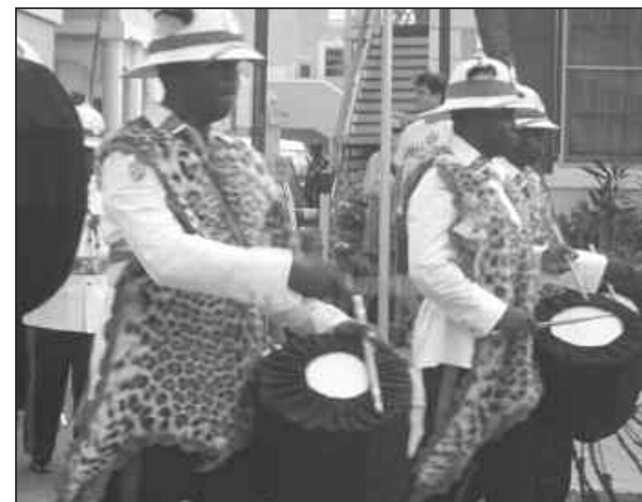
The funeral procession we witnessed in Nassau.

Trashmore. The Casino in Lucaya was a disappointment too. The only saving grace to the area was Rumrunner's, a little hole-in-the-wall bar that served the best conch fritters for only $4 and Sands beer, which is made on the island, 2 for $5.