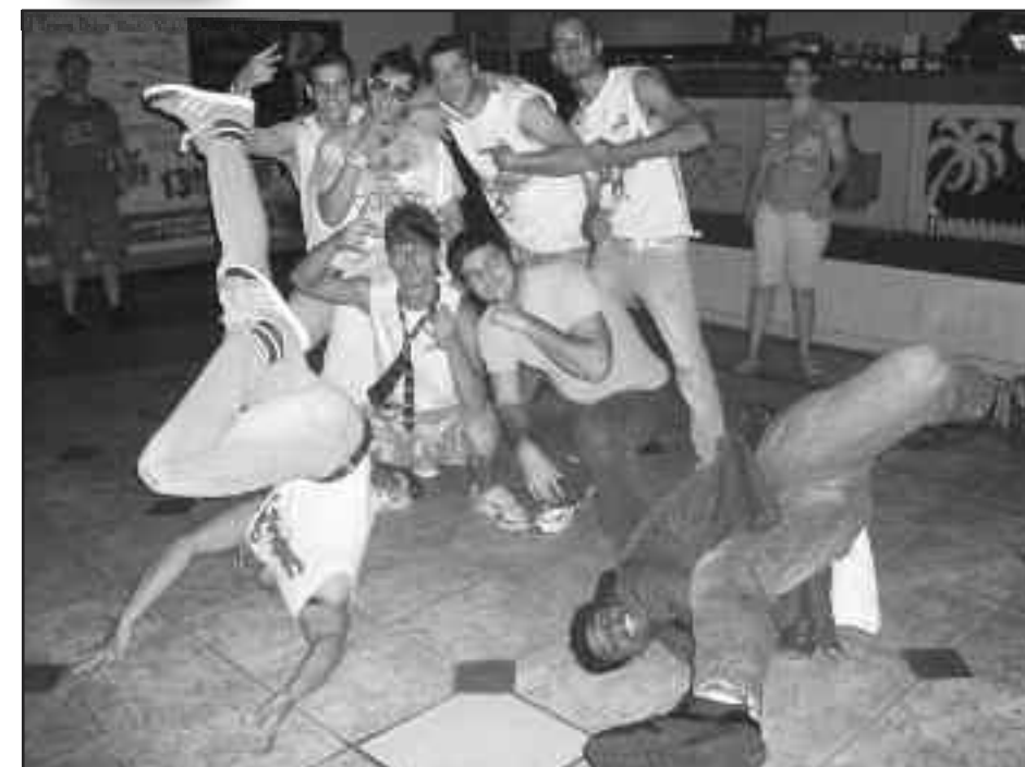
The dancers at the Flip Flop Dance Hop.