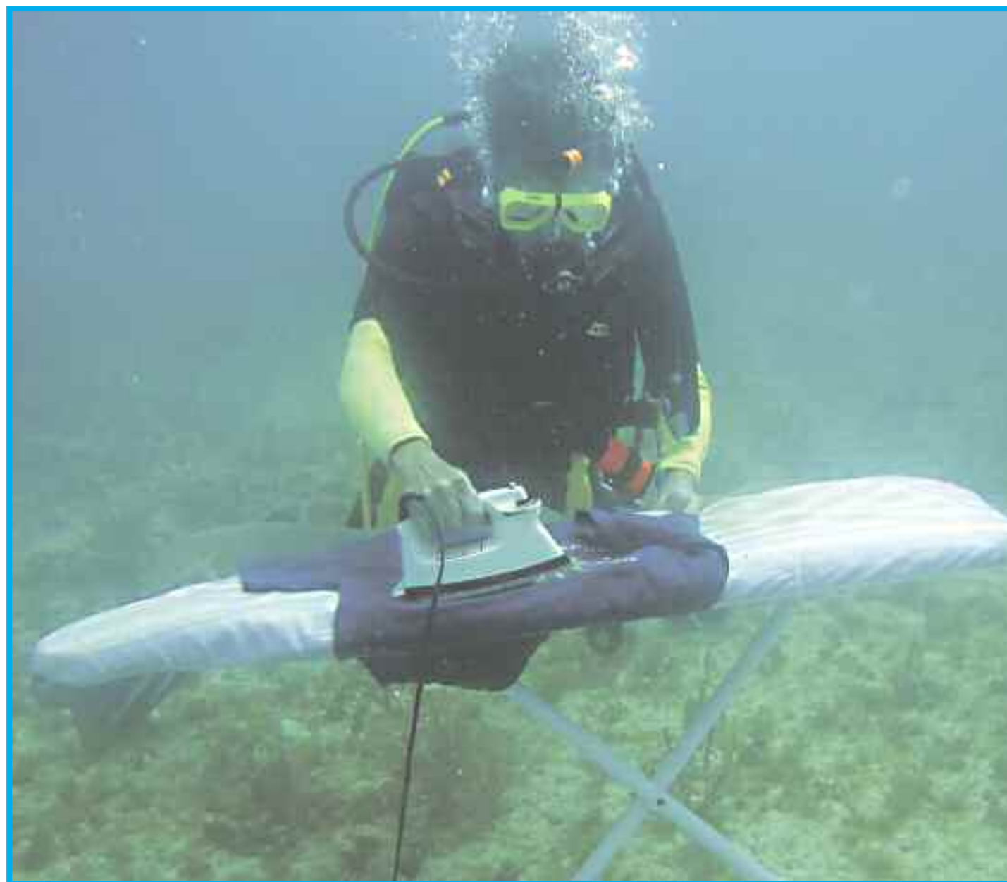
Extreme Underwater Ironing comes to Key Largo! On May 1st, each participating diver will take an iron and ironing board, and set up underwater by the Christ Statue to iron one item within a 10-minute time limit...under the watchful eye of adjudicators. Key Largo needs at least 100 people to successfully do this, to take the world record from the Brits... so sign up today!