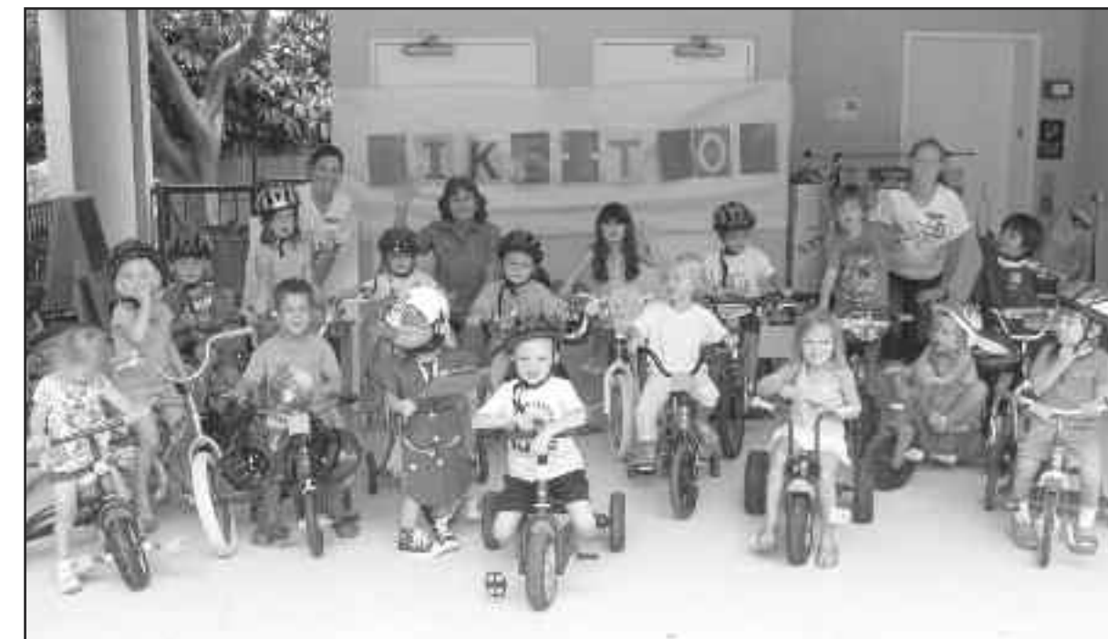
St. James children line up with their bikes for bike safety awareness.