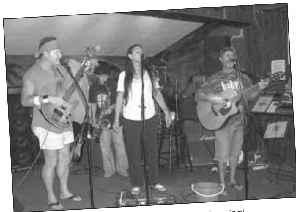
Jam night at the Caribbean Club. Amazing!