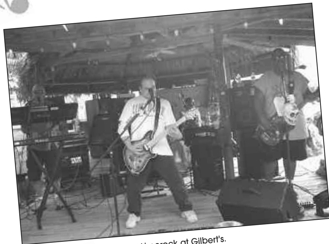
Limerock at Gilbert's.