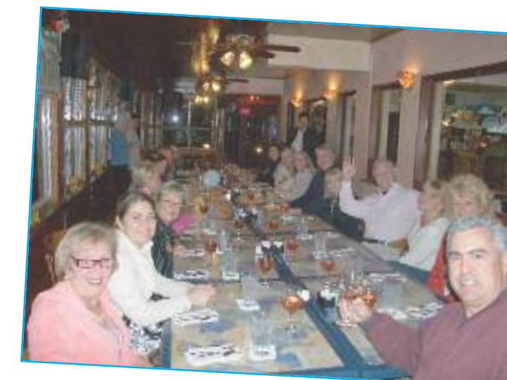
A lot of happy faces at Pontunes.