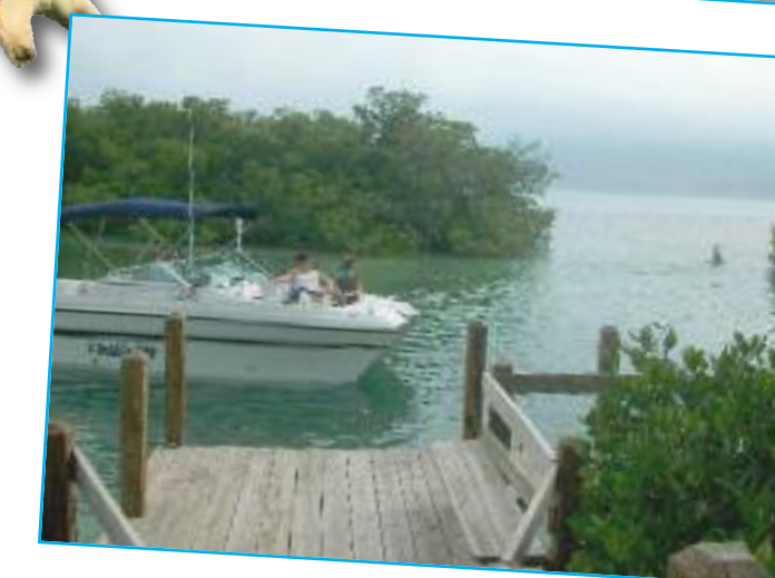
The Island Grill has a fabulous new bar and roof but nothing beats the great food and spectacular view!