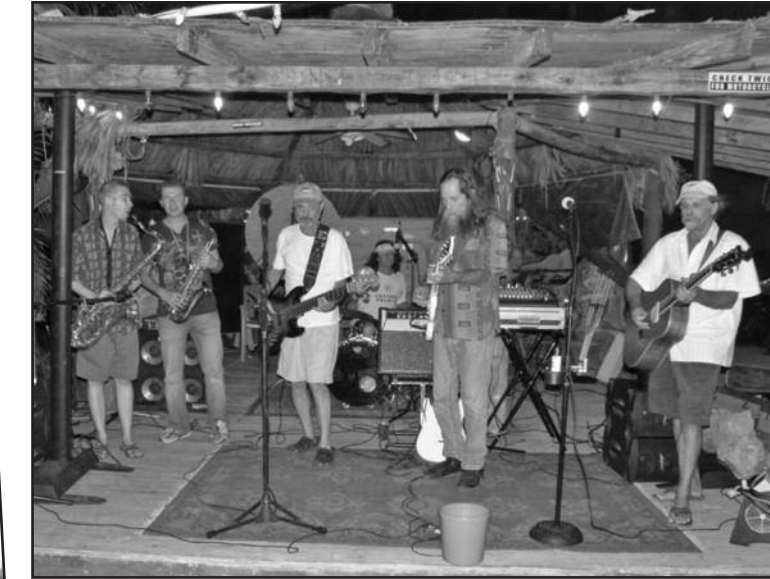
Monday night is "Jam Night" at Gilbert's Resort. Stop by the waterfront bar located at mile marker 108.