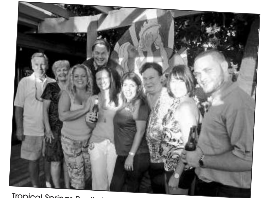
Tropical Springs Realty having a great party at Sundowner's.