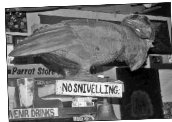
Rumor has it the Green Parrot was reportedly just purchased by Pat Croce.