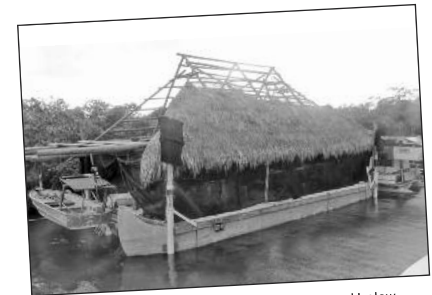
Quite the party barge or floating home found below Jewfish Creek Bridge.