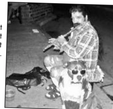
Live entertainment is every where at the Southern most point.