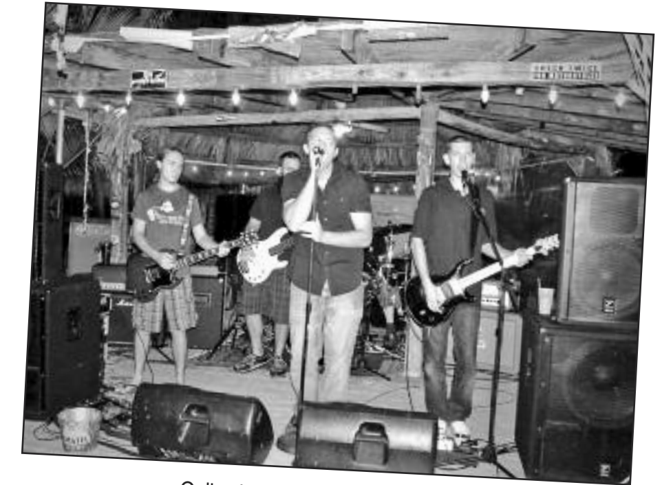
Colbert the Band at Gilbert's Resort.