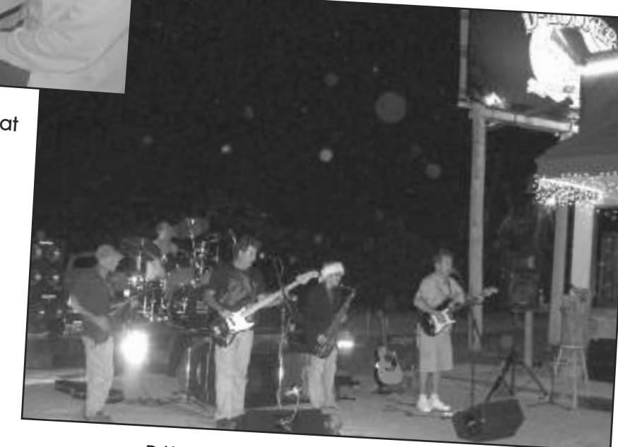
D-Hooker now has live entertainment!