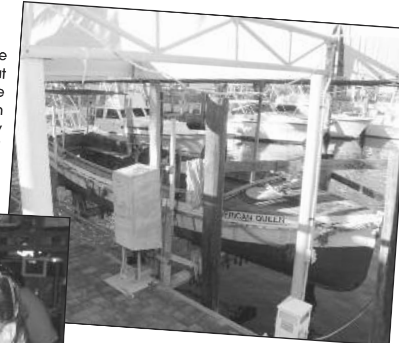
Docked next to the Key Largo Princess at the Holiday Inn, the famous African Queen is a Key Largo "must see."