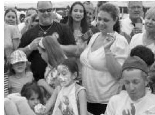
Pie Eating Contest