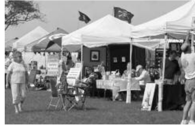
Vendors and Information Booths