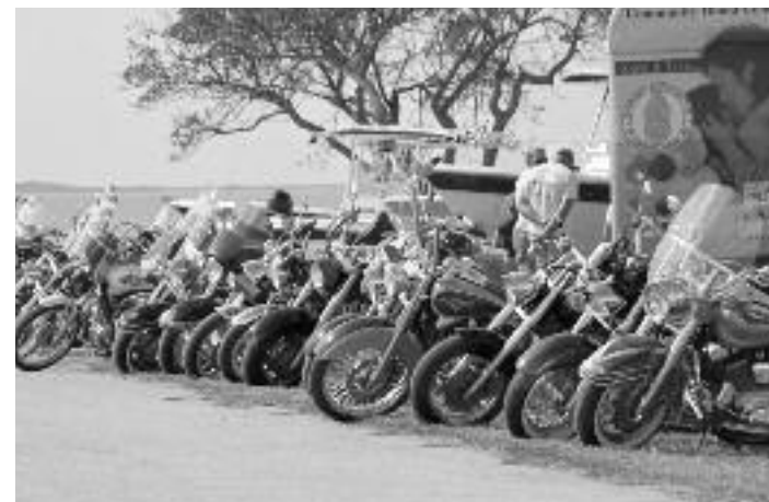
Boat Show • Car Show on Sunday