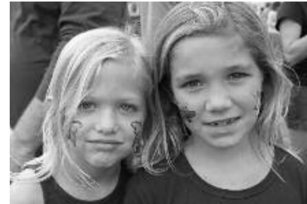
Face Painting & More for Kids