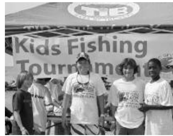
Kids Fishing Tournament