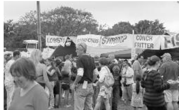
TONS of Fresh Seafood!!