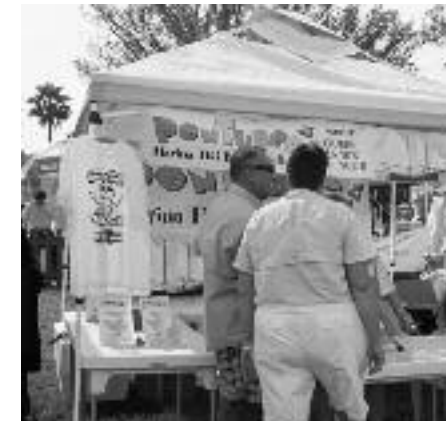
Shopping & Discounts