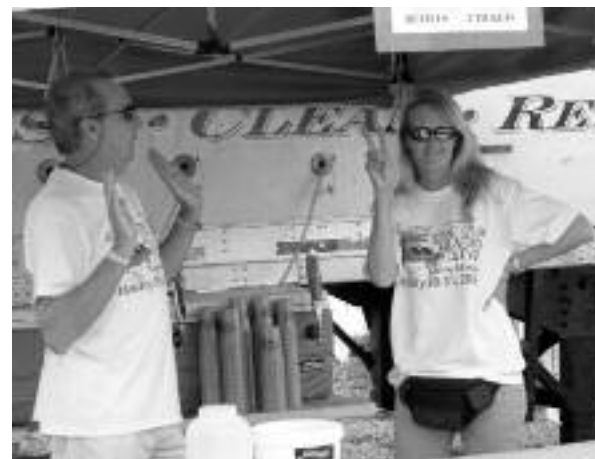
Plenty of Cold Adult Beverages