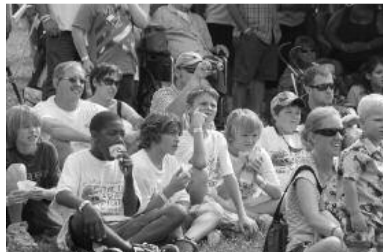
All kinds of live entertainment