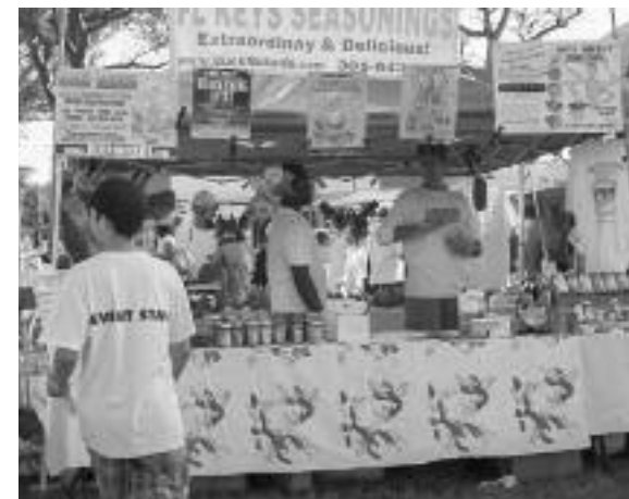
Tastings & Giveaways