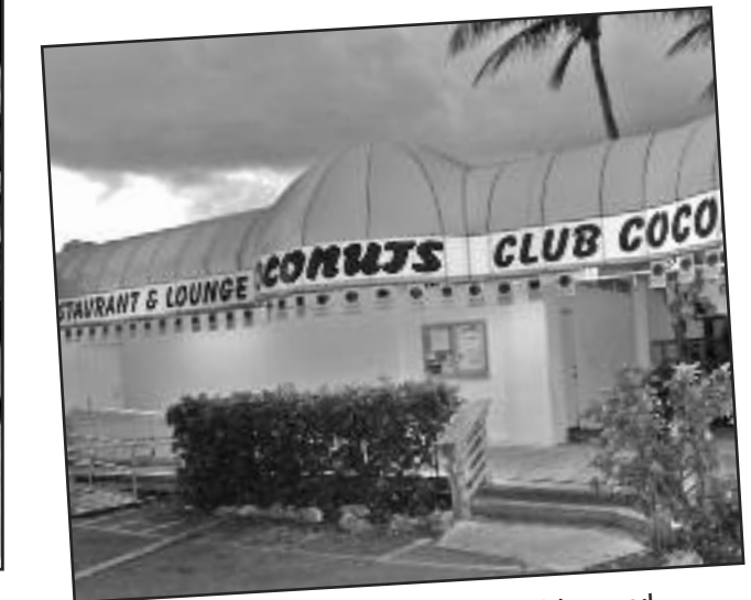
Best place to dance the night away!