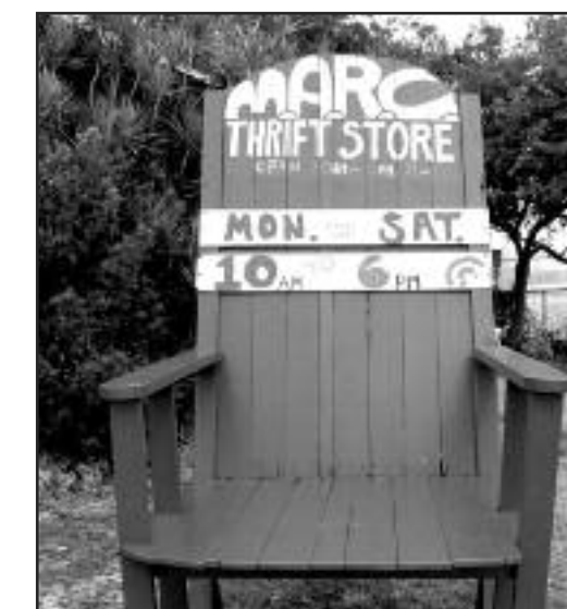
Due to cut backs, the Monroe County Association for Retarded Citizens desperately needs donations for their thrift shop next to Coral Shores High School. Please help them care for those who cannot care for themselves.