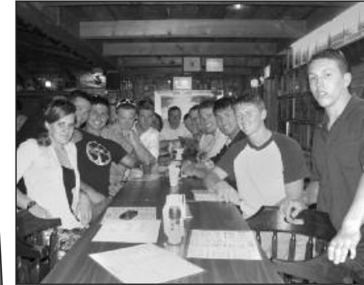
After two weeks of diving in the Keys, the West Point Cadets enjoyed their last night at the Whistlestop.