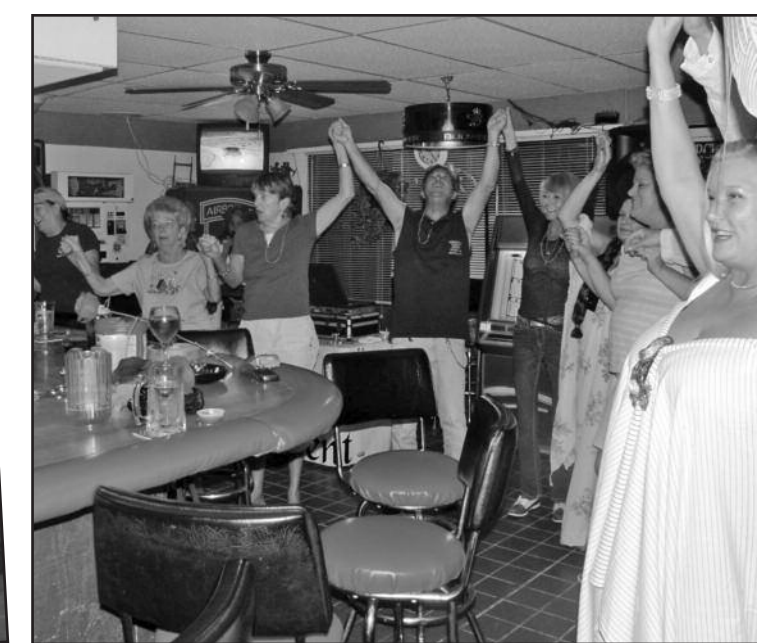
Most patriotic organization in the Upper Keys, the VFW.