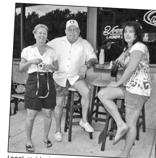
Local residents and car enthusiasts organize a local car show held the first Saturday of every month at various locations in Key Largo.