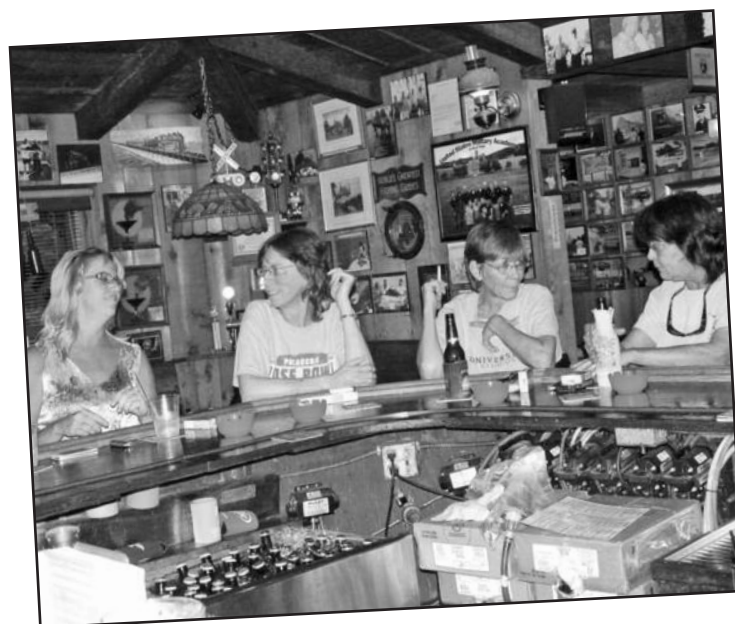
Lovely ladies at the Whistle Stop.