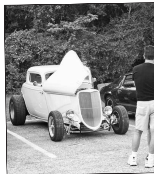
A recent car show held at D-Hooker.