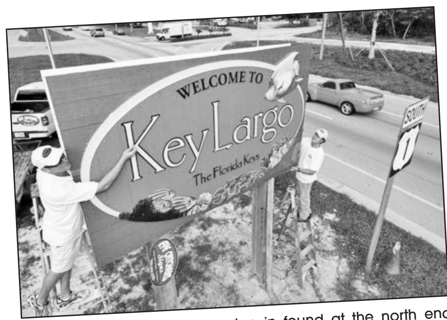
The new, beautiful welcome sign in found at the north end of Key Largo.