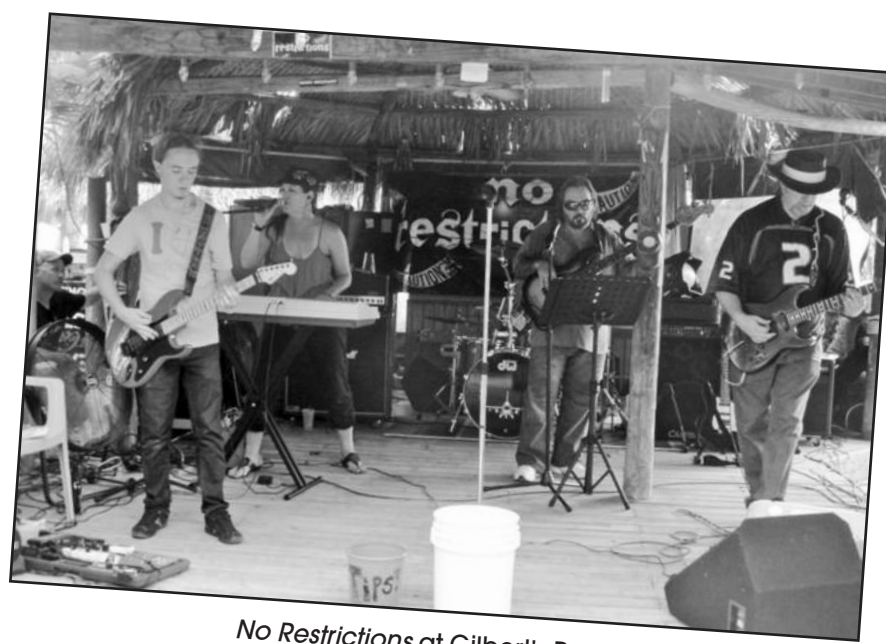
No Restrictions at Gilbert's Resort.