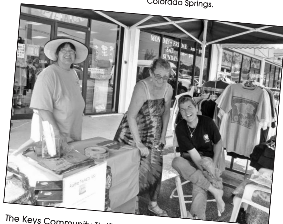
The Keys Community Thrift Shop in the Central Plaza near mile marker 103 threw a plaza party.