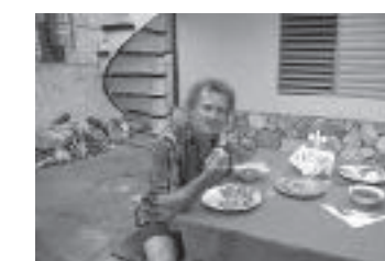
"It tastes like chicken!"