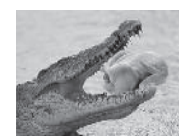
Fishing for crocs.