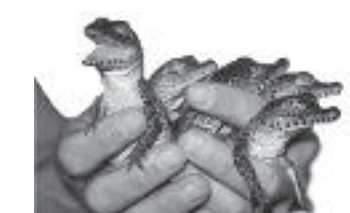
Genetically modified baby crocs.