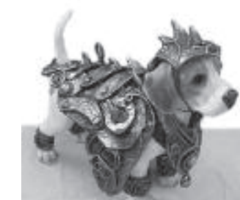
Body armor for pets and people.