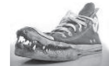
Designer crocodile shoes.