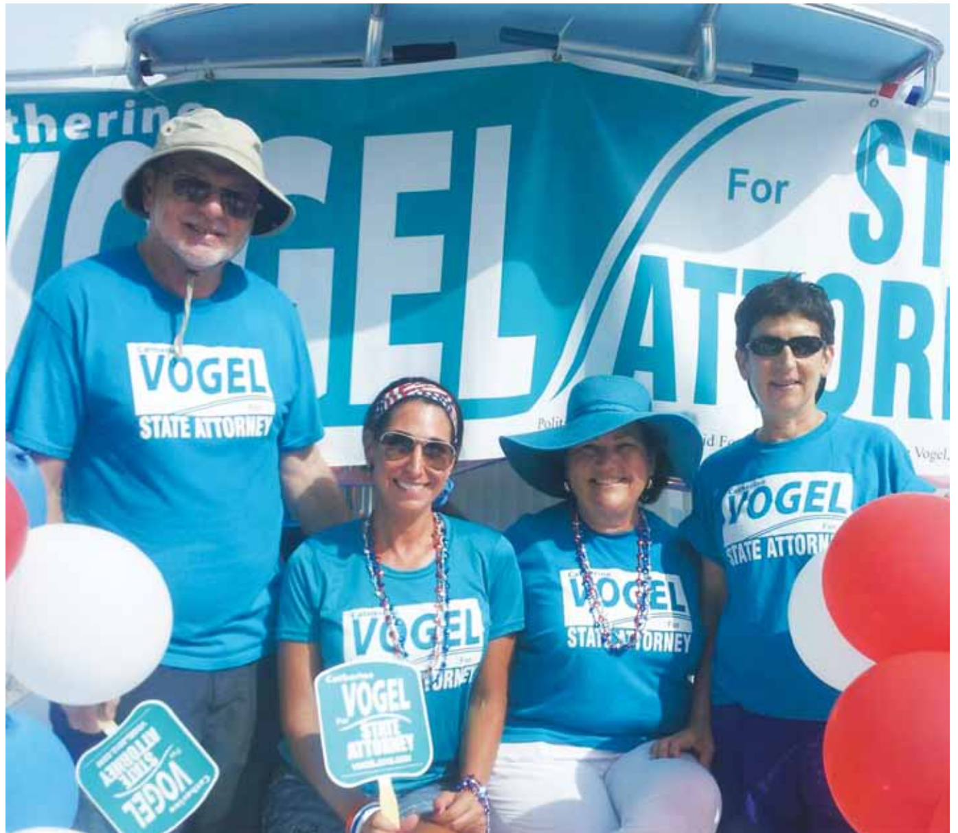
A fabulous 4th of July parade this year! Kudos to the Key Largo Chamber of Commerce for promoting the parade, and for their first-ever community picnic event, another smashing success.

Dear Anny Bannanny Chronic Lateness; whose time is more important? Coco-Nut Funnies Conch Characters