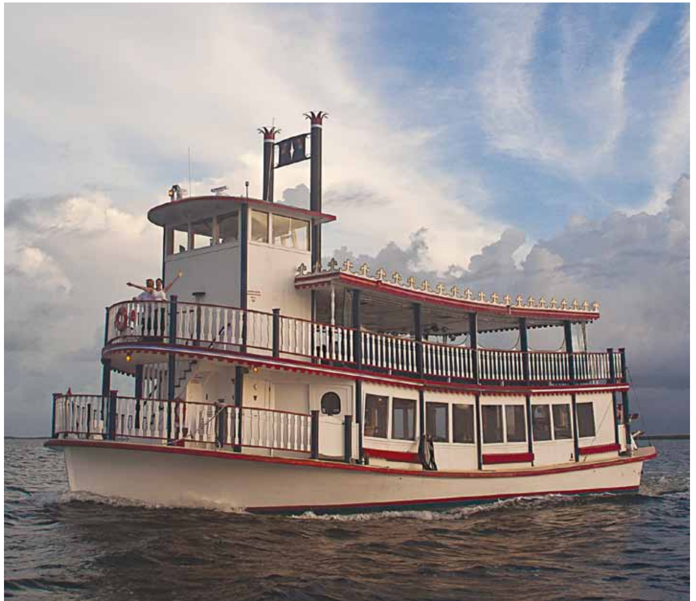
The Keys' newest on-the-water attraction is "Island Time," a 78-ft. paddlewheel riverboat sailing the waters of Blackwater Sound with two bars, dining, unparalleled sunset views and dolphin sightings... all while listening to live music or local DJs. For more information call 305-453-0001 or visit www.IslandTimeCruises.com .