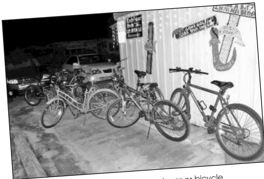
Visit the Pilot House by boat, car or bicycle.