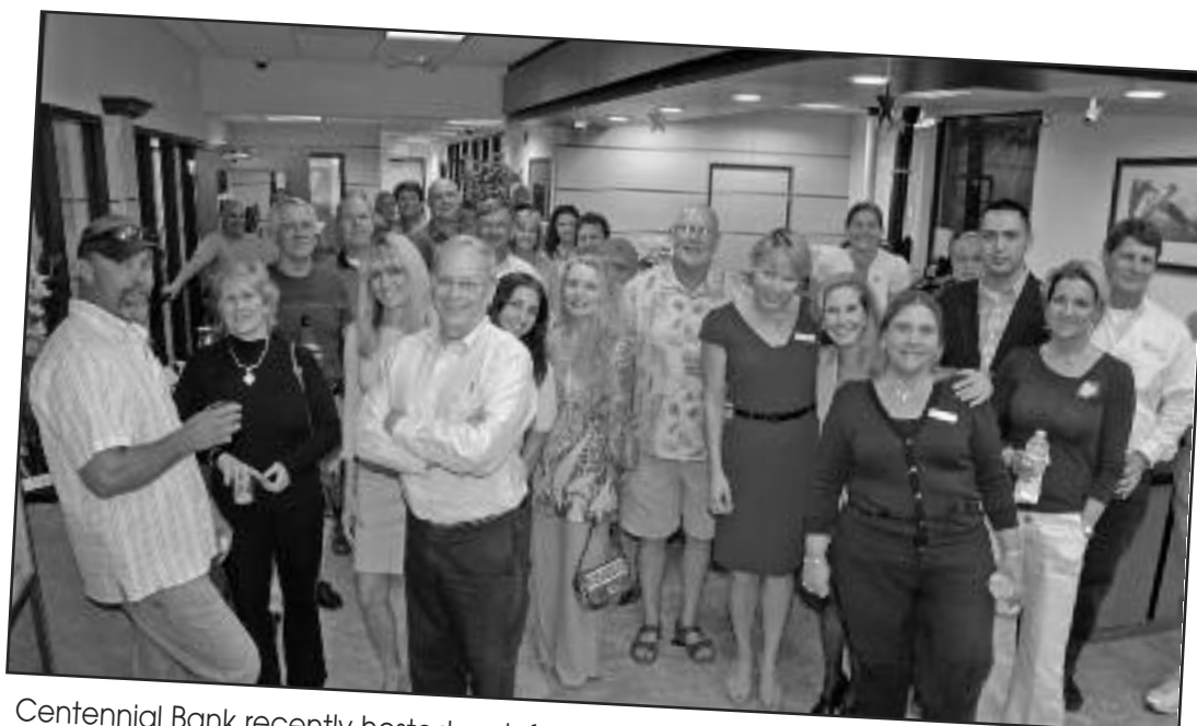
Centennial Bank recently hosted an informal gathering for friends of the bank to toast the new year