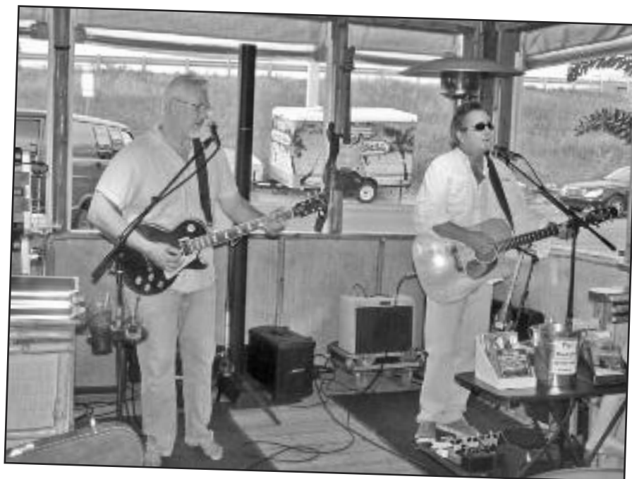
Great entertainment at the Island Grill.