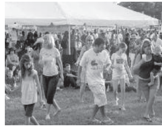
Music, Dancing, Fun!