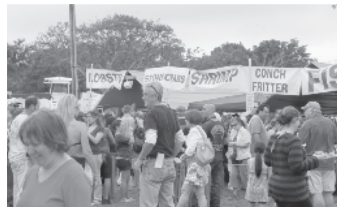
TONS of Fresh Seafood!!