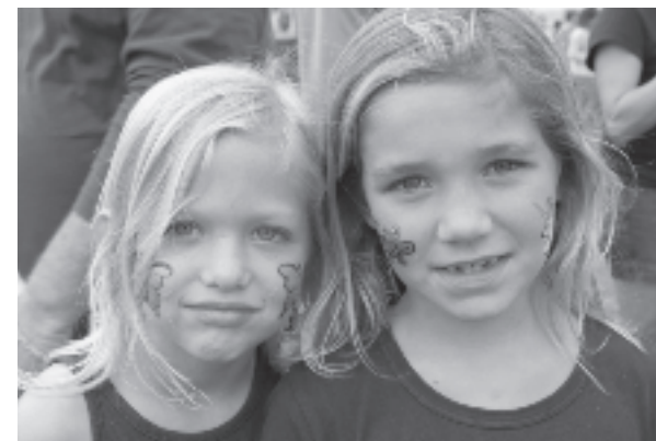
Face Painting & More for Kids