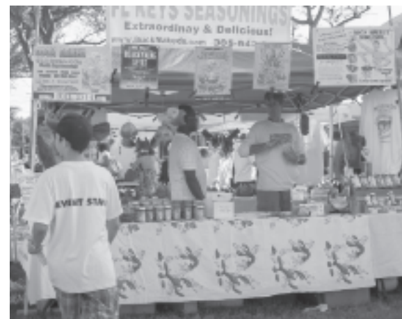
Tastings & Giveaways