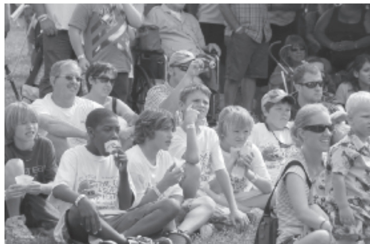
All kinds of live entertainment