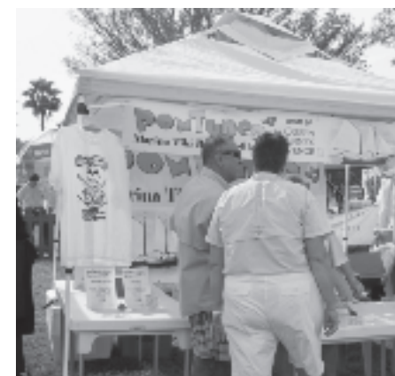
Shopping & Discounts