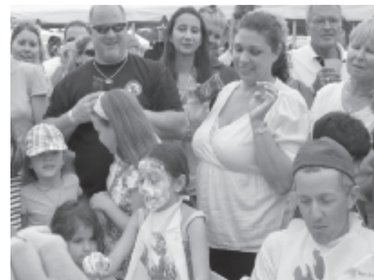
Pie Eating Contest