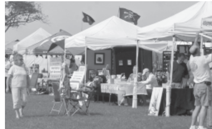
Vendors and Information Booths