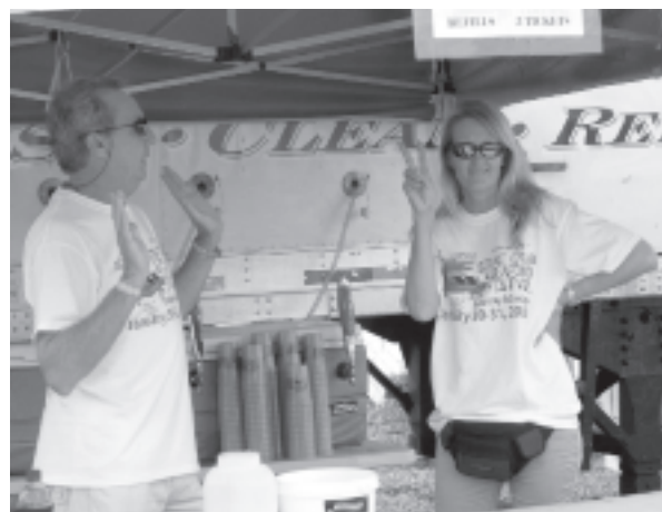
Plenty of Cold Adult Beverages