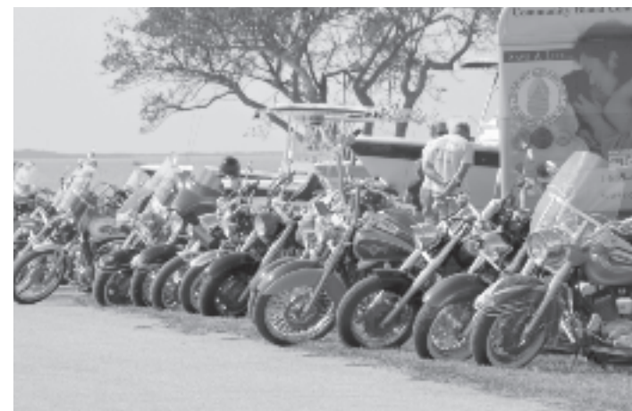
Boat Show • Car Show on Sunday