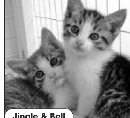
Jingle & Bell