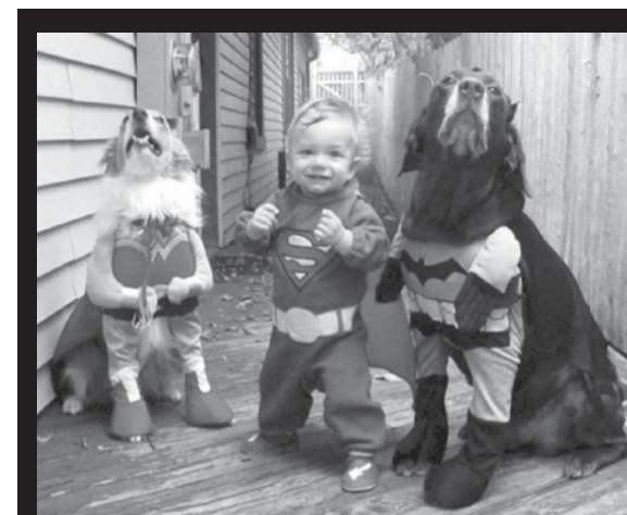
DOGS THEY GOT YOUR BACK

Please bring your pet on a leash to the benefit Nov. 17th and get a