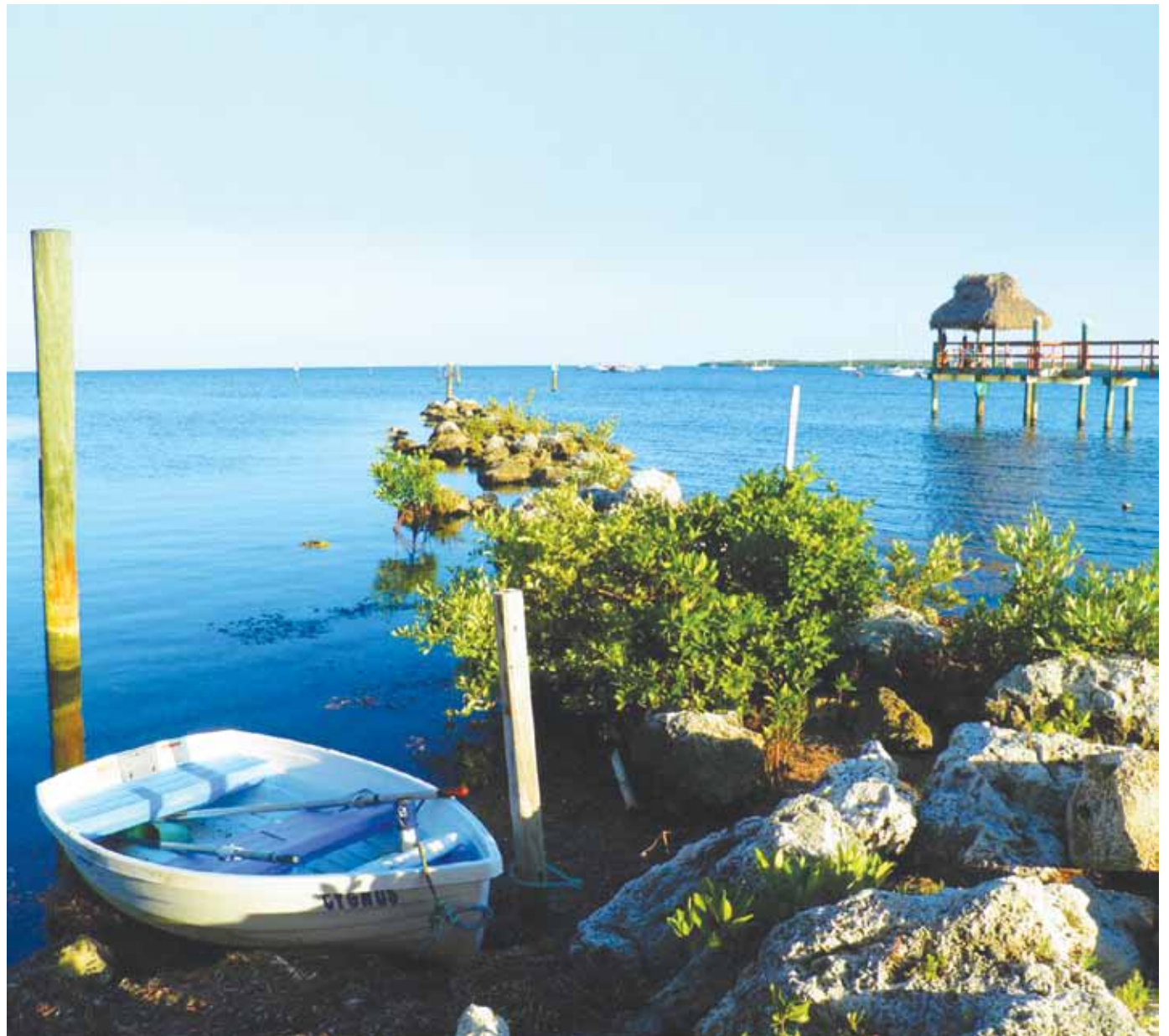
View from the new ocean bar at the Mandalay.