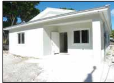
3/2 GROUND LEVEL BRAND NEW HOME Home owners park, great location. Quality and custom features. Call for details.