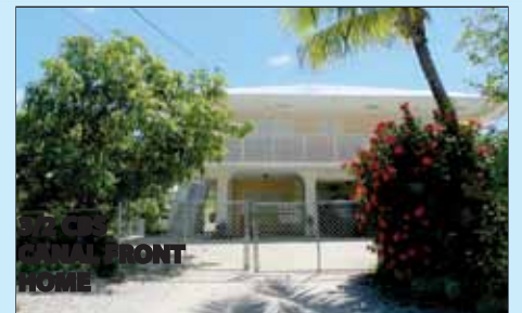
3/2 CBS CANAL FRONT HOME

Ocean side. Fenced. Clean, clear canal. Spacious living space. Open plan. Big patio overlooks canal. Will not last long!!!