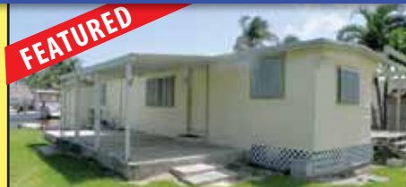
4/2 OWNER FINANCING CANALFRONT MOBILE Fenced, davits and nice seawall. Nicely furnished and ready to move into. 20% down.