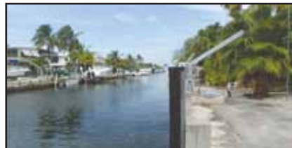
CANALFRONT IN TROPICAL ATLANTIC SHORES - TAVERNIER STRAIGHT OUT TO THE OCEANFRONT. Updated kitchen. 2 bdrm up and an apartment down, plus workshop. Porches on street side and canal side. Concrete roof. Beautifully landscaped. Fenced. Very close to schools... Call for an appointment.