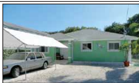
LISTED TO PENDED IN 15 DAYS Port Largo 3/2 family home We can sell yours quickly too!