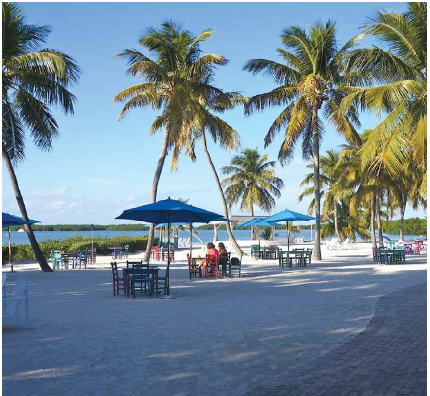
View from the Morada Bay Beach Cafe - home of the Full Moon Party. See ad on page 9.

Dear Anny Bannanny Coco-Nut Funnies Conch Characters