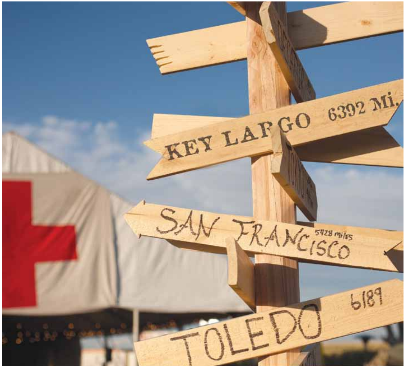
M.A.S.H. Party to benefit the Good Health Clinic: Saturday, May 11 at the Lions Club in Key Largo. Another great event by the Pirates on the Water, aka the Parrot Heads. For details see page 11.