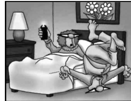
"It's a taser. It's for your snoring."

Apparently there's more traffic going to Hell.