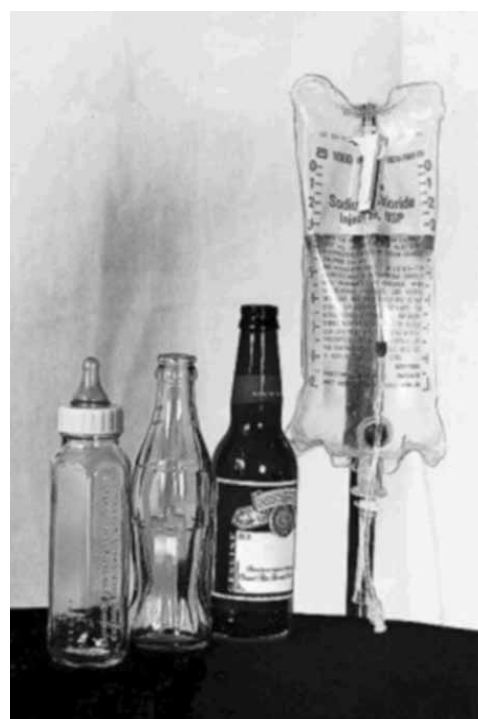
The four stages of Life.

"I think it is just terrible and disgusting how everyone has treated Lance Armstrong, especially after what he achieved, winning seven Tour de France races while on drugs. When I was on drugs, I couldn't even find my bike." — Willie Nelson