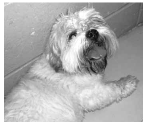
What if you take this dog from Miami-Dade County...

The terrified dog ran across the busy 6-lane highway, darting between cars and oncoming trucks just to reach the dried up chicken wing that was laying in the dirt by the side of the road. The sad little dog's ribs were visible since he hadn't eaten in days, maybe weeks since he was lost and forced to fend for himself on the streets of Florida City.