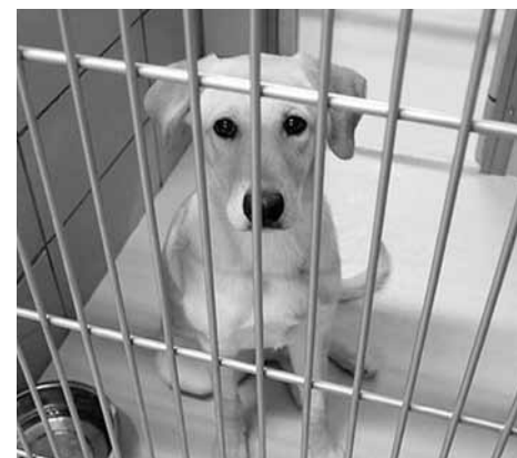
...and then this one doesn't get a home?

Here is the problem and it is a big one. Chances are that even if that dog finds a home here in the Keys it may be taking a home away from another dog! Here is the reason why.