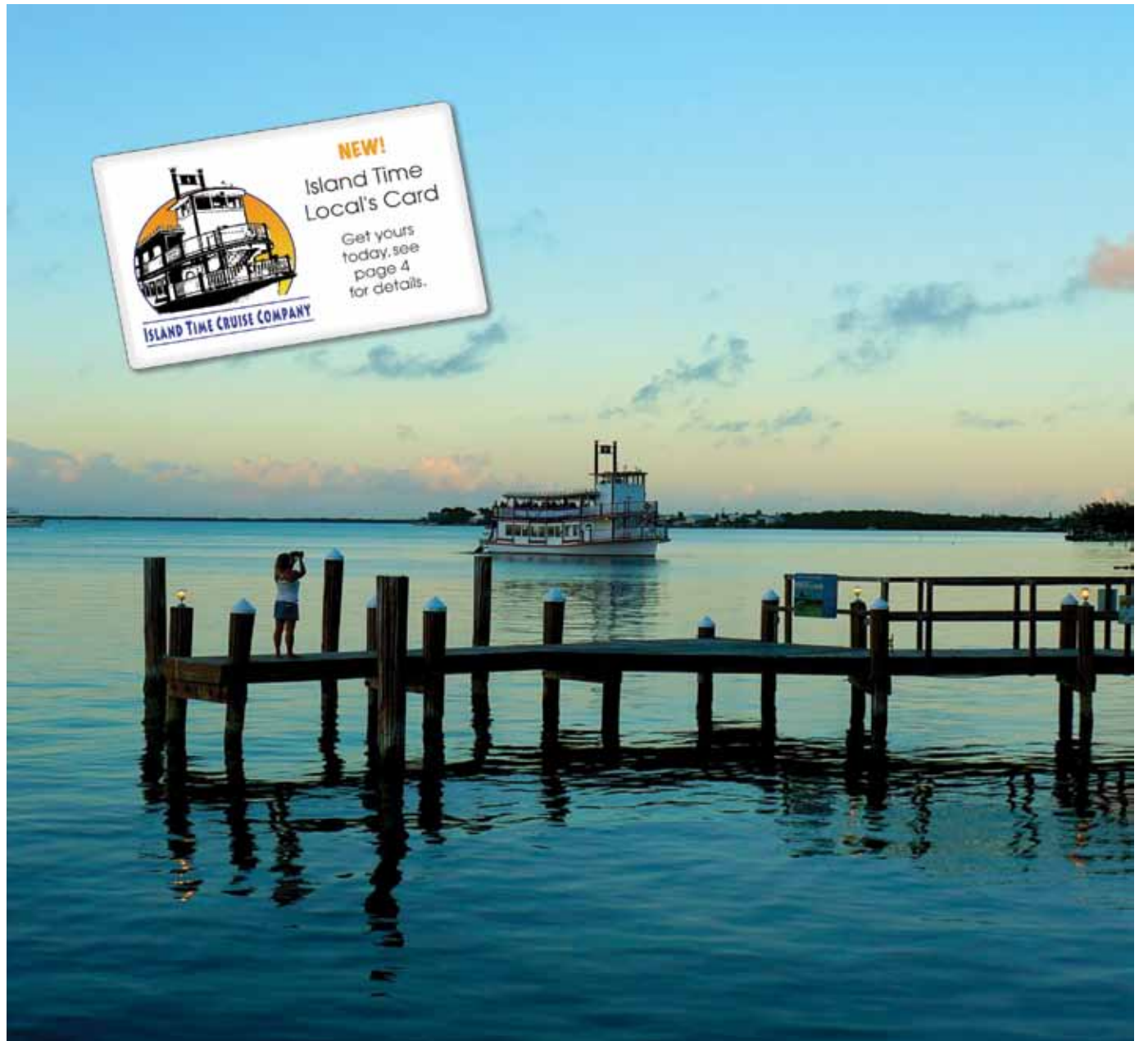
Catch an island sunset and party aboard the Island Time. 305-451-0001.