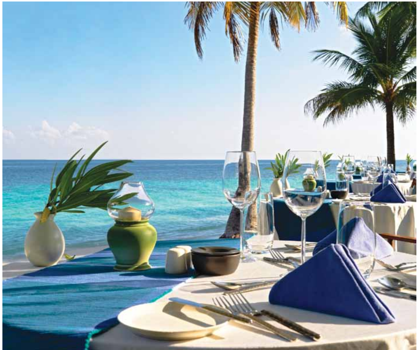
Venues all over the Upper Keys are getting ready for UNCORKED... The Key Largo and Islamorada Food & Wine Festival , starting January 9th and running through the 18th. Featuring over 30 foodie events with Keys and international cuisine, lobster and seafood, cooking demonstrations, a murder mystery dinner, Caribbean paddle-wheel riverboat cruise and even a "Chopped"-style cooking competition, the festival is sure to please locals and visitors alike. See page 7 for more information.